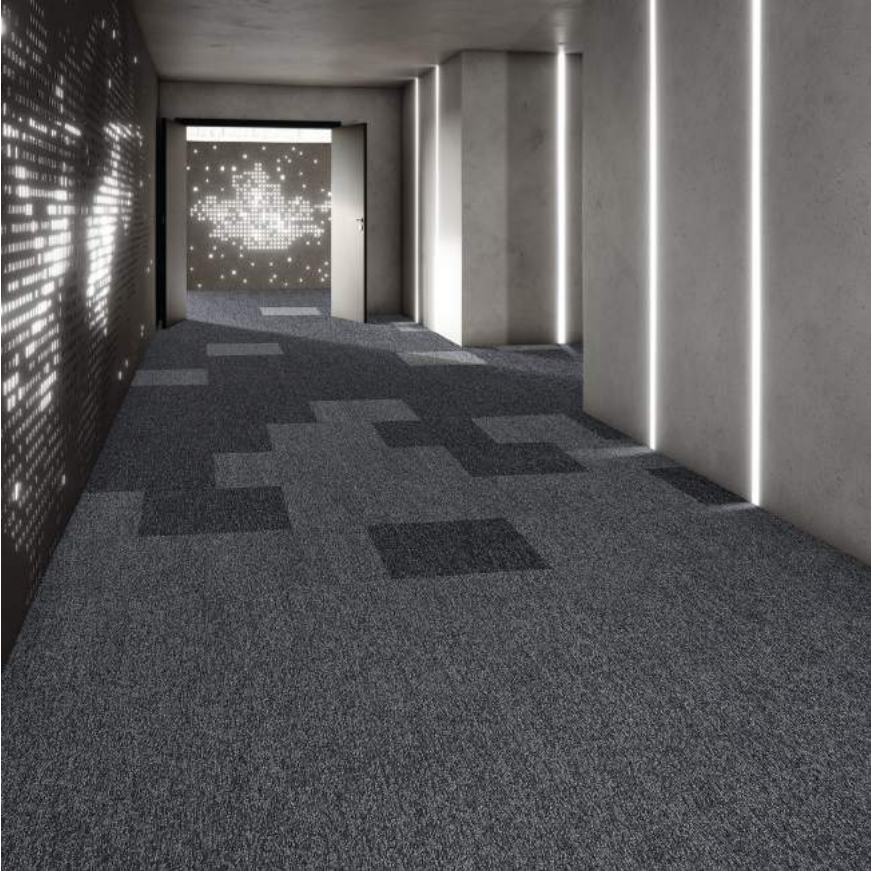
Blaze 553, 961