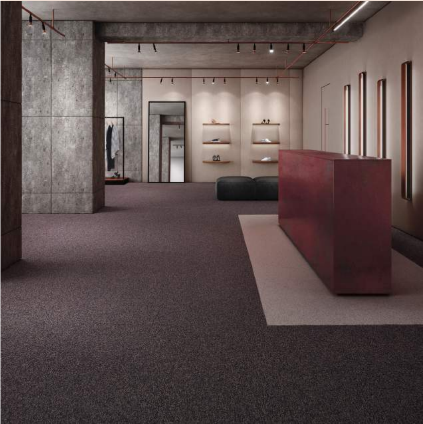
Spark 398 & Gleam 398