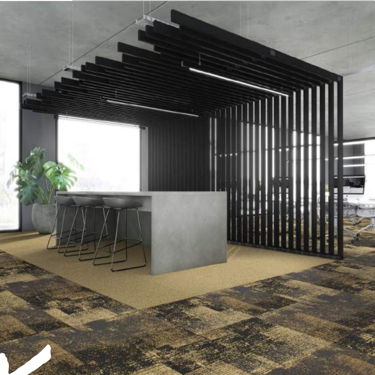
Dusk 21B, 21M & Gleam 212

Dusk captures the final flares of colour and shimmer as the light of day gradually turns to night. Not only does this carpet tile collection draw inspiration from nature with its organic yet geometric design, it also gives back to nature by using the sustainable ECONYL® yarn.