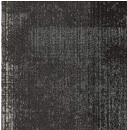
Matt: Dusk 96M