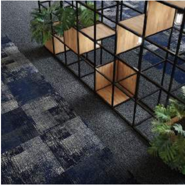
Dusk 55B, 55M & Blaze 553