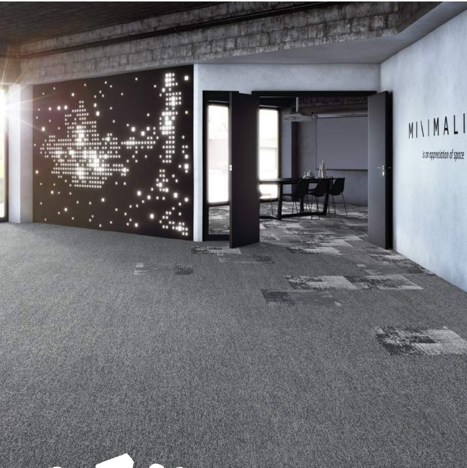
Blaze 961 & Dusk 96B, 96M