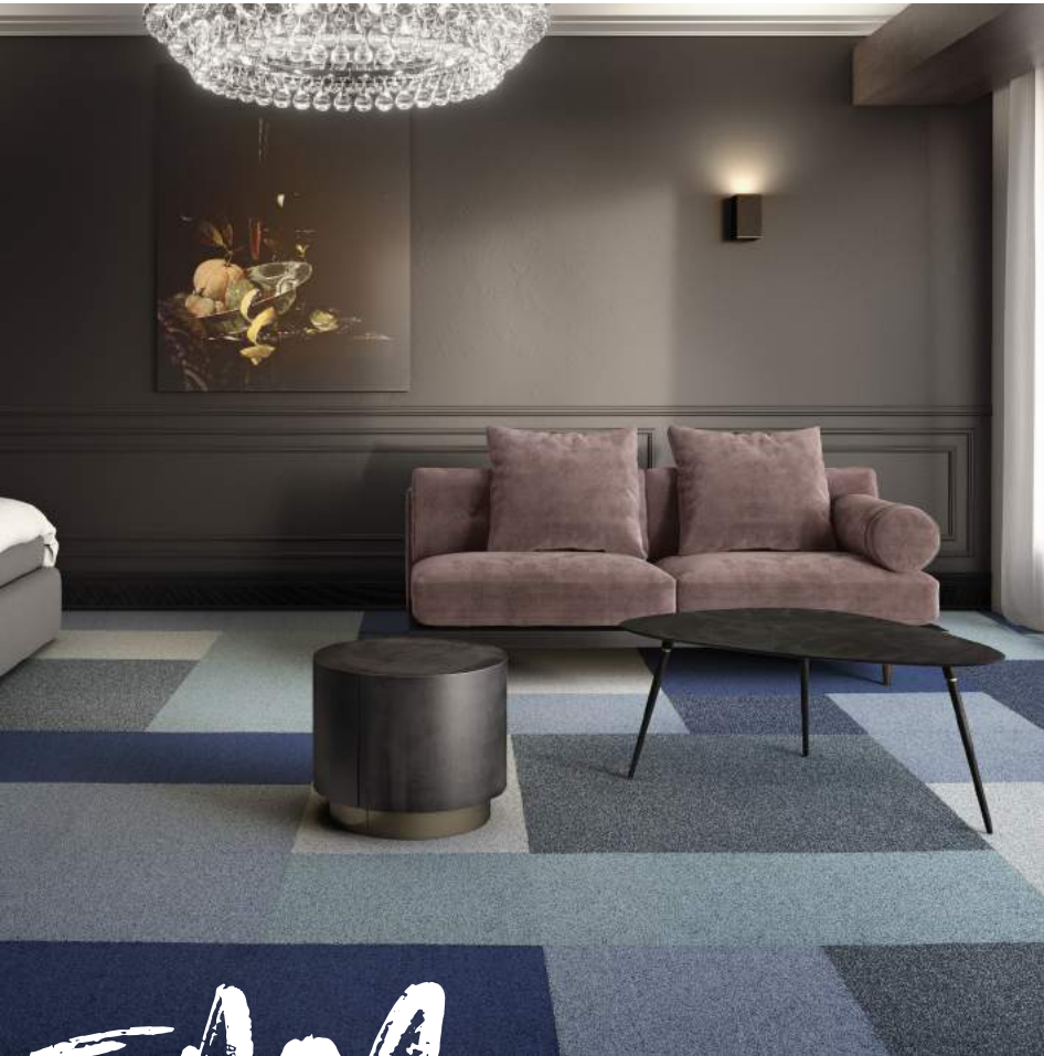
Gleam 511, 535, 569, 581 & Spark 511, 550