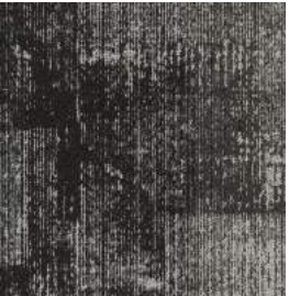
Bright: Dusk 96B