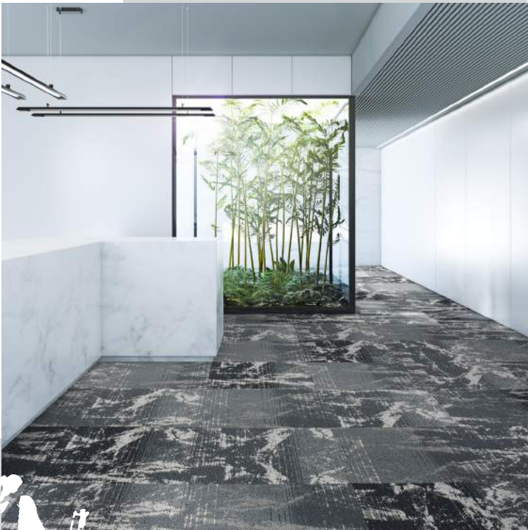
Dawn 57B, 57M, 93B, 93M