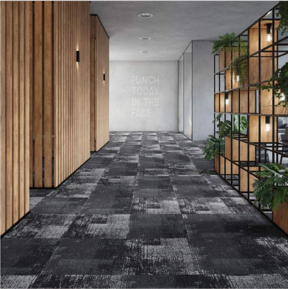
Dusk 99B, 99M