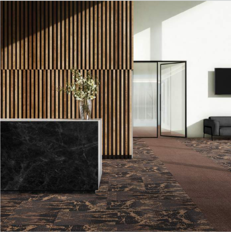
Dawn 82B, 82M & Gleam 306