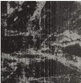
Bright: Dawn 96B