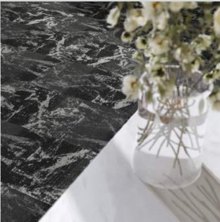
Dawn 96B, 96M