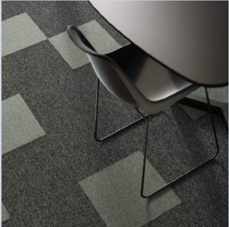
Blaze 668 & Gleam 615