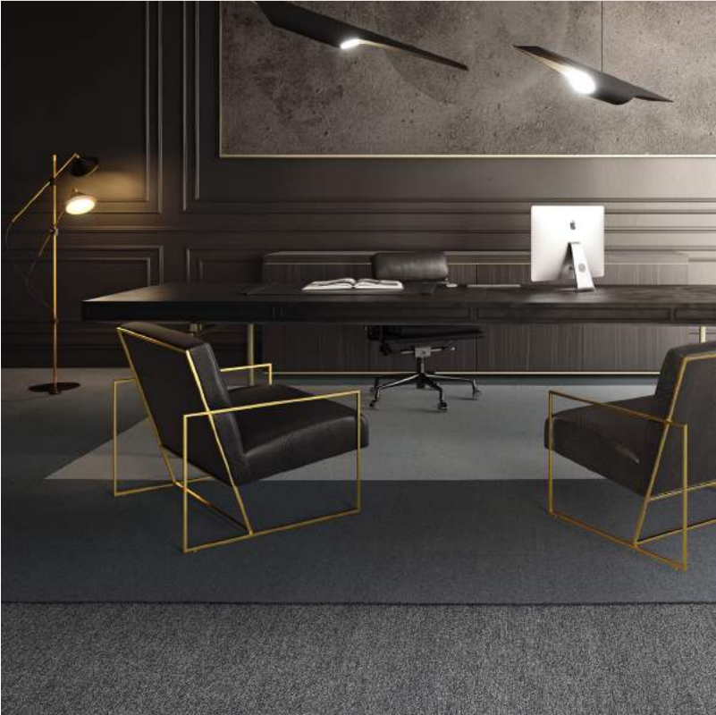
Gleam 020, 966 & Blaze 990